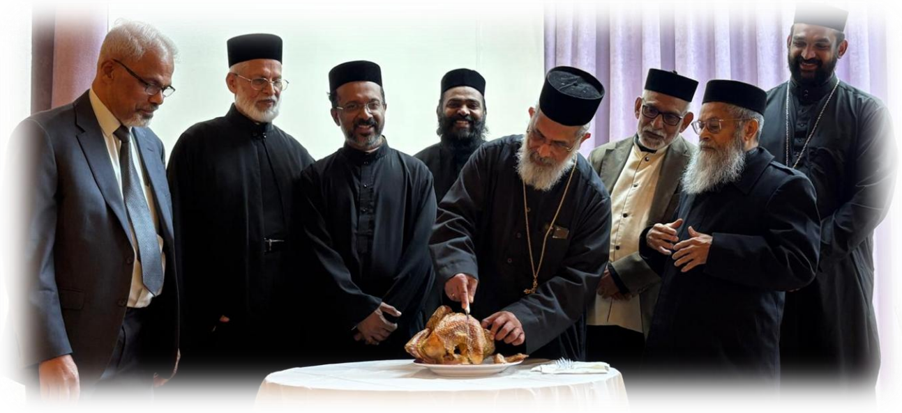
November 28 th : Philadelphia Area MOCF Thanksgiving Day Holy Qurbana was held here at our church. MOCF also conducted a food drive, in this holiday season.