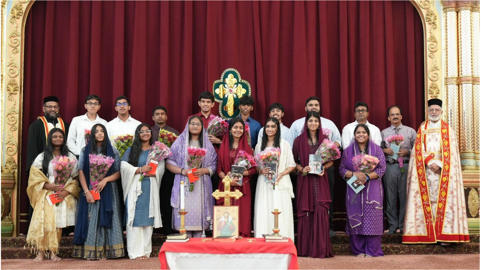
July 28 th : We celebrated over 20 graduates from high school, undergraduate, graduate and professional programs. Congratulations to the Class of 2024!