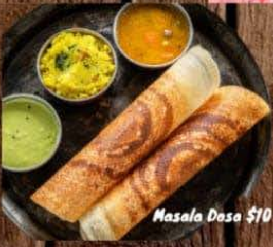
Masala Dosa $10